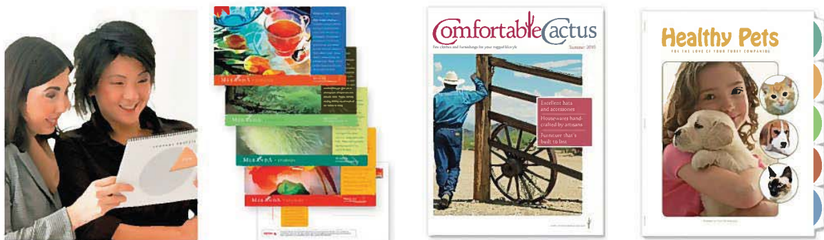
Image quality, ease of use, productivity, media latitude, feeding and finishing options, are at your fingertips. Grow your digital colour printing capabilities and reduce costs with the Color 550/560 Printer.